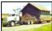
2004-Relocation to Chickasha, OK