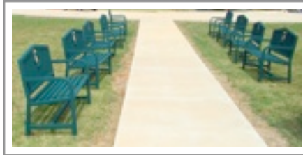
"Educational Visionaries' Walk of Fame" - Dedicated Benches from Chickasha Families & Businesses placed on the site of the historic Verden Separate School