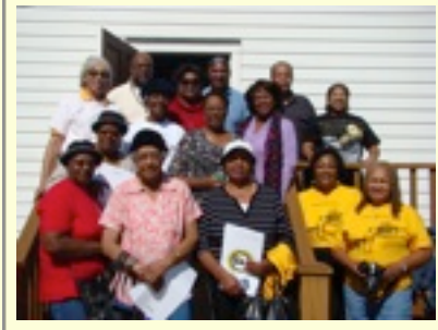
Oklahoma Black Heritage Committee holds quarterly meeting at the historic Verden Separate Schoolhouse