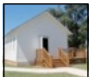
2007-Restoration Complete 2010-Designated "Historic Site" by City of Chickasha