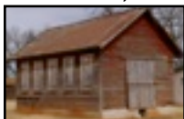
2005-Nat'l Register of Historic Places